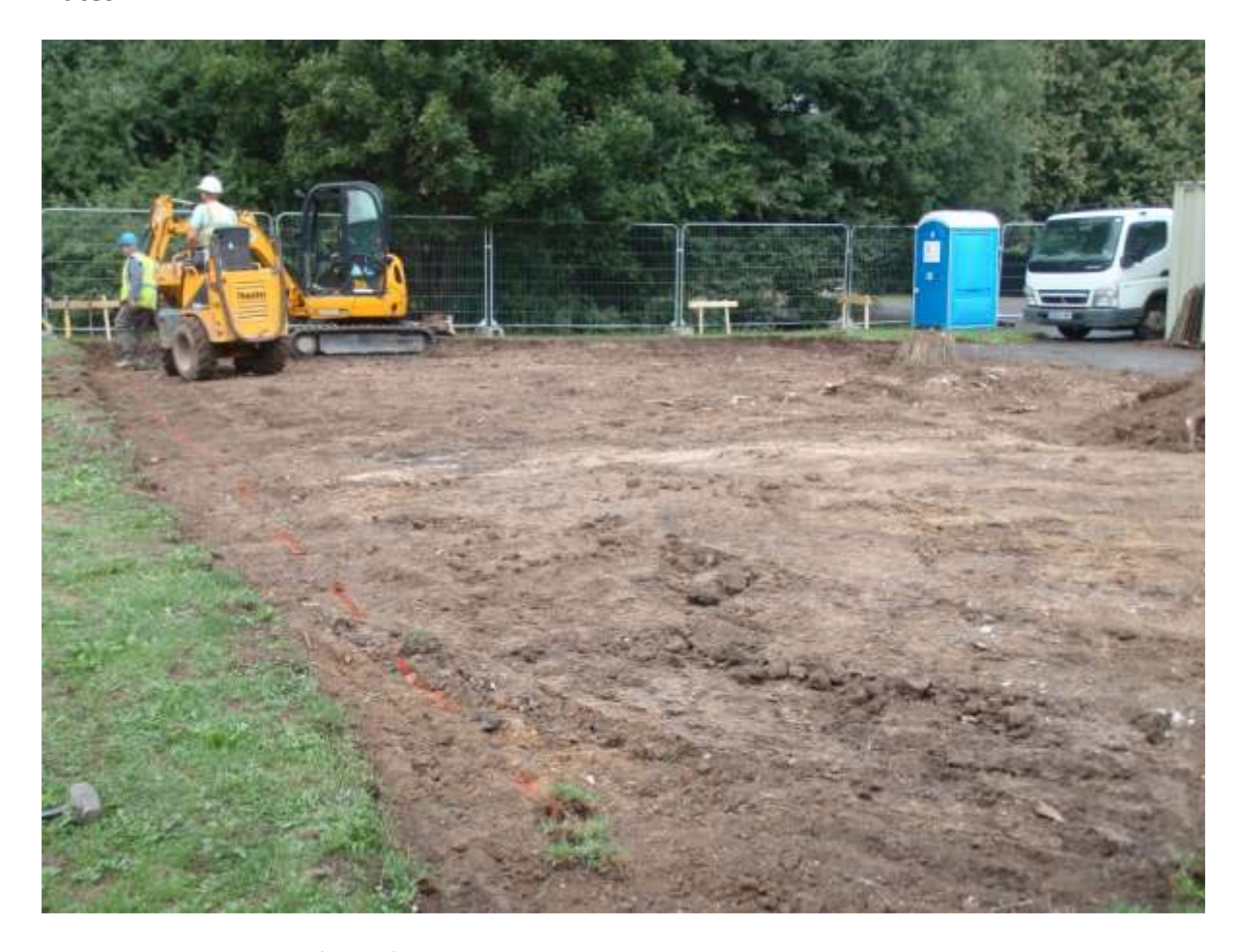
Plate 2. General view of site, facing north-west