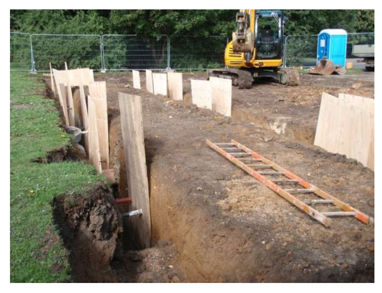
Plate 4. Foundation trenches (facing west)