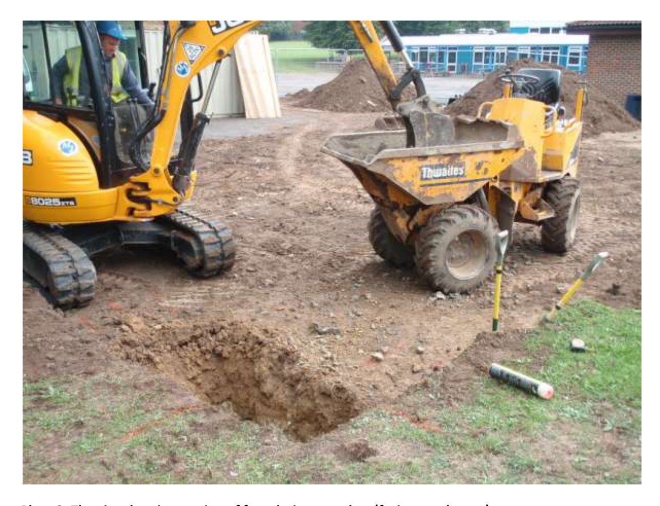
Plate 3. The site showing cutting of foundation trenches (facing north-east)